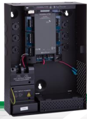
ME-1015 with AC-225IP-DIN