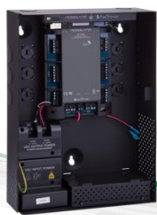
ME-1015 with AC-215IP-DIN

Secure Power Management Enclosure for AC-215x, AC-225x, and AC-425x