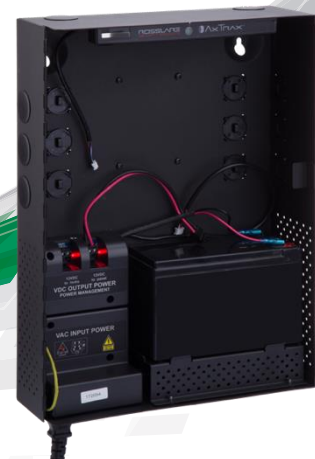
ME-1015 Enclosure (battery not included)

The ME-1015 power management enclosure is a lockable metal cabinet with an innovative 15 V, 4 Amp power supply featuring a UPS circuit designed to fit and power Rosslare's 425x, 225x, and 215x series of access control panels. The enclosure has a built-in speaker for generating audio alerts from the panels and features the Rosslare PowerLock™ and the Rosslare LightBar™ utility light. The enclosure provides a premium solution to plug-n-play systems ease of setup and provides long-term reliable performance for value and peace of mind when installing Rosslare access controllers.