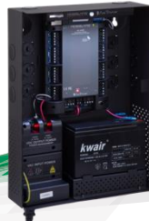
ME-1015 with AC-425IP-DIN