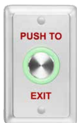
Plastic Slim Piezoelectric REX Switch with Light Ring