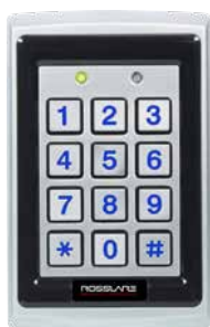
Anti-Vandal MIFARE® Contactless Smart Card Sector Reader with Keypad