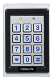
Anti-Vandal US Single Gang CSN SELECT™ Convertible Reader with Keypad