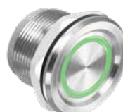
Small Metallic Piezoelectric Push Button with Ring LED