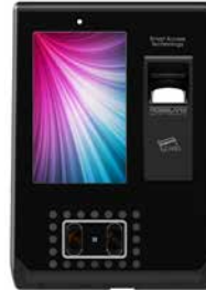
Face & Fingerprint Recognition Reader with dual RFID Card Reader & PIN Code