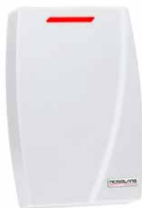
MIFARE® Contactless Smart Card Sector Reader