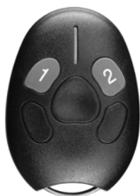
2-Channel Transmitter for AY-L23 Receiver