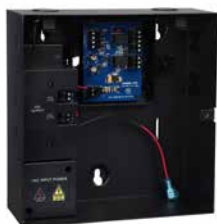
Power Management Enclosure with built in Secure Relay I/O Module