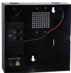
Multipurpose Power Management Enclosure