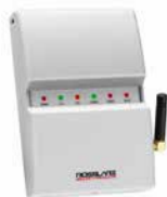
Wireless Access Control Door Interface Near Unit / Far Unit