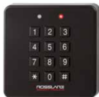
UK Gang Box CSN SELECT™ Convertible Reader with Keypad