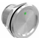
Small Metallic Piezoelectric Push Button with Spot LED