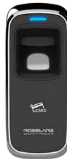
Anti-Vandal Fingerprint & Card Reader for outdoor use