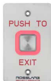
Digital Piezoelectric REX Switch with Toggle Option