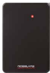
US Gang Box CSN SELECT™ Reader