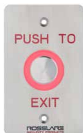
Analog Piezoelectric REX Switch with Toggle Option