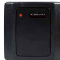
UK Gang Box Sized Proximity Reader