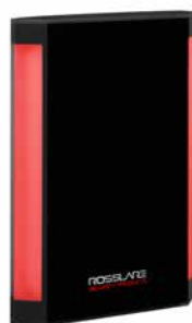
Illuminated CSN SELECT™ Smart Card Reader