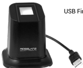
USB Fingerprint Scanner