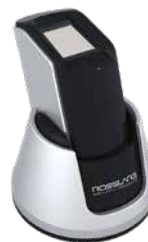
USB Fingerprint Scanner