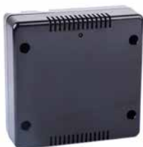
Secure Relay I/O Module