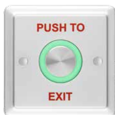
Plastic Slim Piezoelectric REX Switch with Light Ring