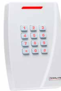
MIFARE® Contactless Smart Card Sector Reader with Keypad