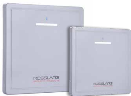
Long-Range UHF-RFID Reader with Bluetooth BLE-ID