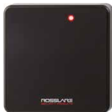
UK Gang Box CSN SELECT™ Reader