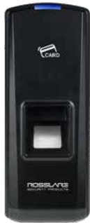
Fingerprint & Card Reader for indoor use