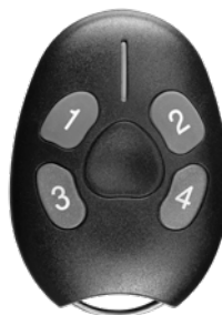
4-Channel Transmitter for AY-L23 Receiver