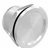
Small Metallic Piezoelectric Push Button