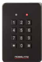
US Gang Box CSN SELECT™ Convertible Reader with Keypad