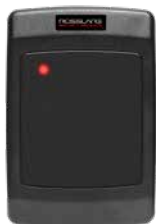
US Gang Box Sized Proximity Reader