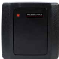
UK Gang Box Sized MIFARE® Contactless Smart Card Sector Reader