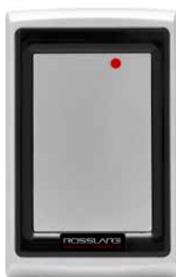
Anti-Vandal US Single Gang CSN SELECT™ Reader