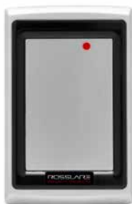
Anti-Vandal MIFARE® Contactless Smart Card Sector Reader