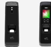
AY-B9120BT AY-B9250BT AY-B9150BT