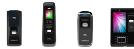
AY-B8550 AY-B9250BT AY-B8650 AY-B9350