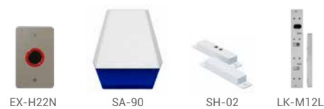
EX-H22N SA-90 SH-02 LK-M12L