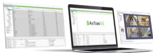
AxTraxNG™ Management Software

The networked controllers are compatible with any standard Wiegand peripheral device, including Rosslare readers, biometric terminals and accessories – all fully managed by the AxTraxNG™ management platform.