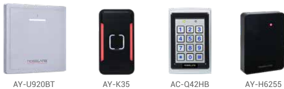
AY-U920BT AY-K35 AC-Q42HB AY-H6255