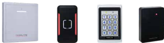
AY-U920BT AY-K35 AC-Q42HB AY-H6255