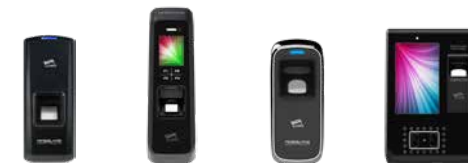
AY-B8550 AY-B9250BT AY-B8650 AY-B9350