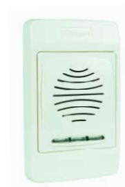
Compact Bell and Strobe Unit for Standalone Controllers