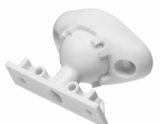
Wall and Ceiling Bracket for PIR Detectors