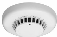
Photoelectric Smoke Detector