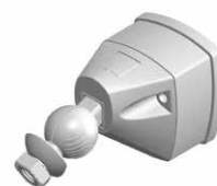
Swivel Wall and Ceiling Bracket for PIR Detectors