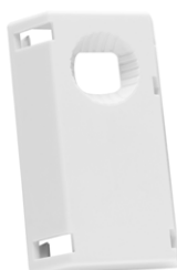
Wall Bracket for PIR Detectors