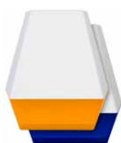
Piezoelectric Siren and Strobe