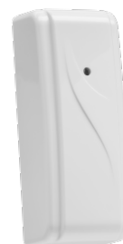
Hardwired Vibration Detector