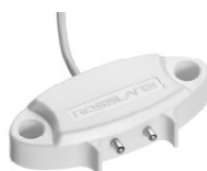
Wired Flood Detector