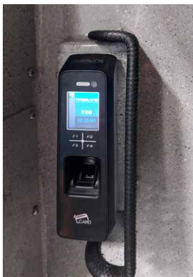
AY-B9250BT Fingerprint Biometrics Reader

Both access points were controlled through Rosslare's AC-825 access control panel, a powerful and flexible security hub. The entire system was seamlessly integrated with the AxTraxPro™ management platform, enabling real-time monitoring, remote access control, and automated security policies. Even in the event of a network disruption, the system's offline functionality ensured that operations remained uninterrupted, maintaining a strict security protocol across the fleet.